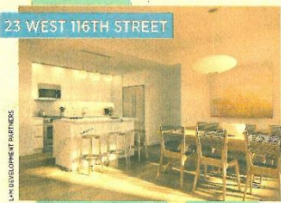
L+M DEVELOPMENT PARTNERS