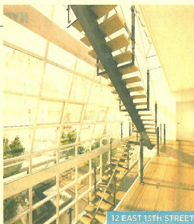
12 EAST 13TH STREET